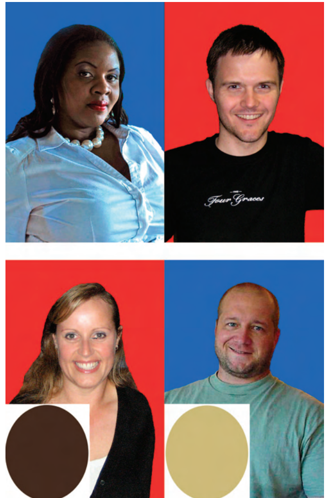
Figure 1. Stimuli in the race-relevant condition varied by race (top panel), while stimuli in the race-neutral condition varied by sticker color (bottom panel). Clockwise from the top left, photographs are from, respectively, http://www.flickr.com/photos/habesha/2468652885/sizes/o/ , http://flickr.com/photos/exalthim/2563788154/sizes/o/ , http://www.public-domain-photos.com/people/man-6-4.htm , and http://flickr.com/photos/technowannabe/164515893/sizes/o/ . The bottom right photo is in the public domain; all other photos are adapted according to a Creative Commons license ( http://creativecommons.org/licenses/by/2.0/ ).

An experimenter sat facing the participant, holding a single target photo from the array. This target photo was one of two photos, randomly selected from the array at the outset of the study. Participants were instructed to ask yes/no questions to narrow the array down to the single target photo held by the experimenter. Their primary goal—to use the fewest questions necessary—was explicitly stated twice during the course of the instructions and then repeated a third time moments before the task began. Thus,