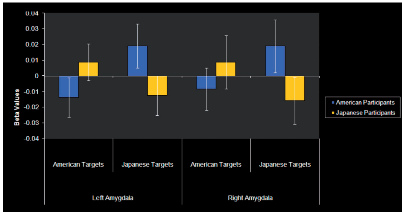
Fig. 2 Mean beta values showing the participant culture by target culture interaction, plotted separately for the left and right amygdalae. Participants showed a greater response to opposite-culture, outgroup targets.

significant clusters of activation for voted over not-voted targets in the right (Talairach Coordinates: 22, -2, -23; 192 mm 3 ) and left (Talairach Coordinates: -22, -6, -20; 275 mm 3 ) amygdalae, as well as in the left superior temporal gyrus (Talairach Coordinates: -41, 2, -15; BA 38; 449 mm 3 ) and right inferior frontal gyrus (Talairach Coordinates: -29, 10, -15; BA 47; 409 mm 3 ). The target culture × participant culture interaction showed two clusters of significant activation: one in the left superior frontal gyrus (Talairach Coordinates: -19, 39, 36; BA 9; 175 mm 3 ) and a second in the left culmen of the cerebellum (Talairach Coordinates: -9, -34, -17; 293 mm 3 ). Mean extracted beta values from these clusters showed an outgroup effect, similar to what we observed in the amygdala ROI analyses above. Specifically, Japanese participants showed a greater response to outgroup, American targets and American participants showed a greater response to outgroup, Japanese targets in both the cerebellar culmen and the superior frontal gyrus.